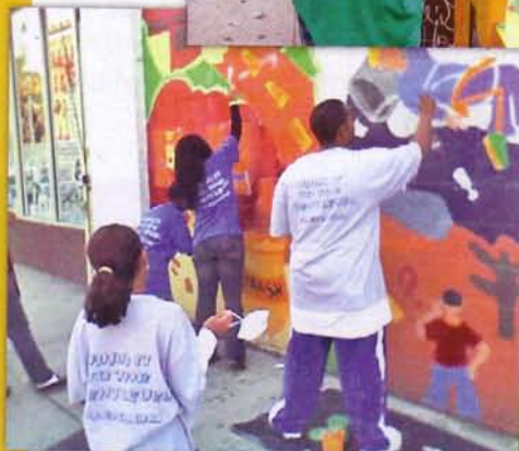
Mural "First Aid"