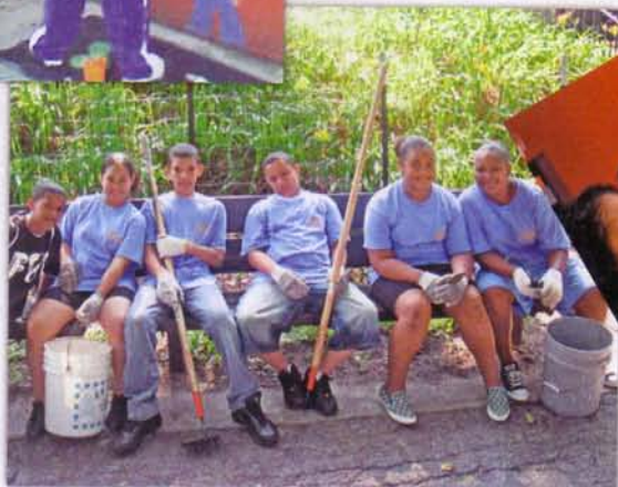
Park Clean Up Crew