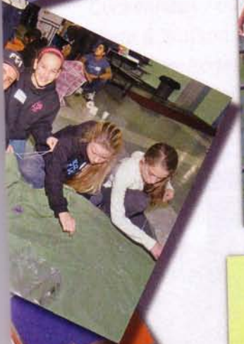
over after service