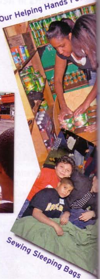
Sewing Sleeping Bags