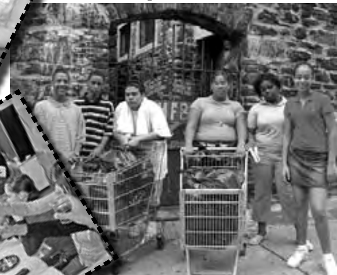
Making Home Deliveries to Food Pantry Clients