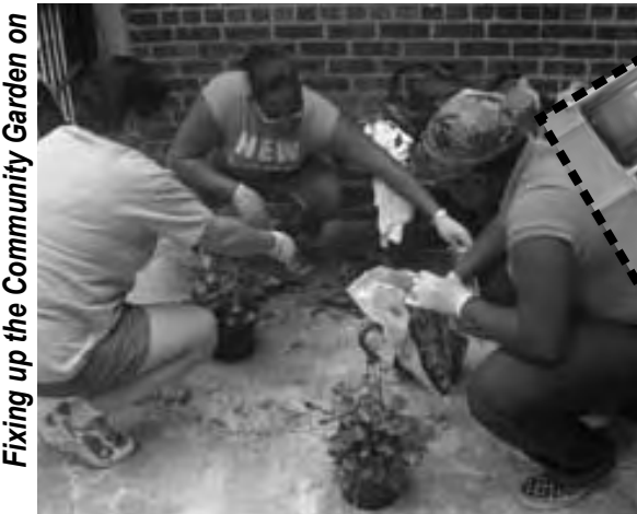
Fixing up the Community Garden on