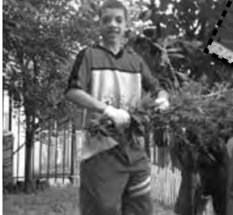
184th Street and Fort Washington Avenue