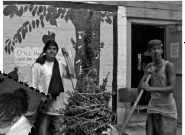
in the Courtyard of PS 128