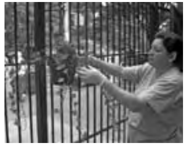
Keepin' it Real at Community Presentations