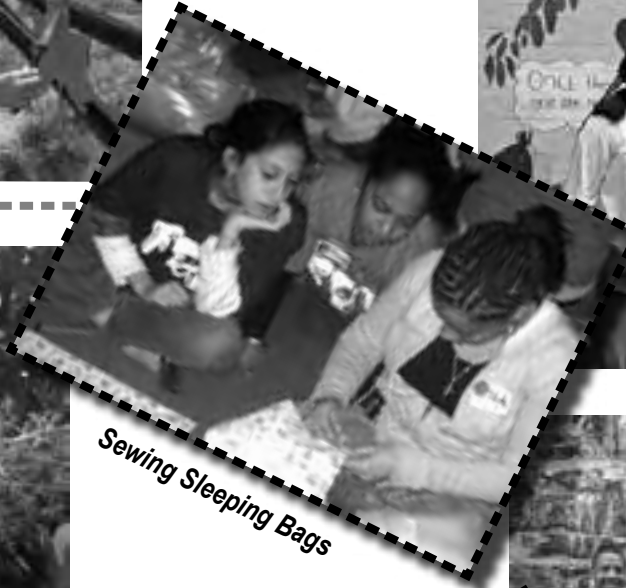
Sewing Sleeping Bags